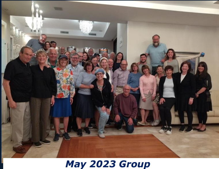
May 2023 Group